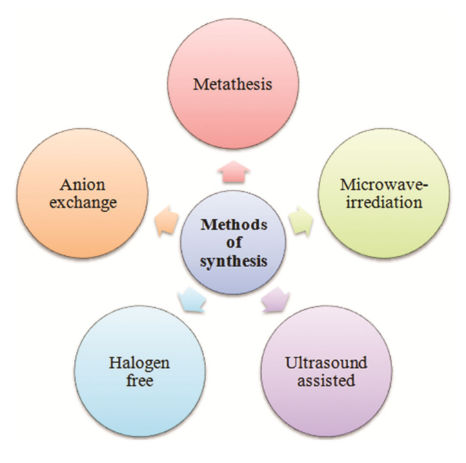
Fig. 2 — Methods of synthesis of ILs

porous material not only ensures thermal and mechanical stability but also improves absorption capacity and selectivity towards specific analytes. So, the ILs composites can be effectively used in fabricating electrochemical sensor for the selective determination of various environmental pollutants.