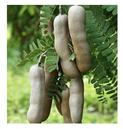
Figure 1 — Photograph of green tamarind fruit