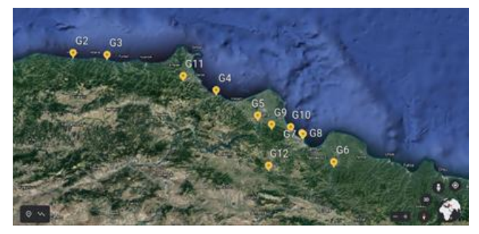
Fig. 1 — Localities of twelve Bituminaria bituminosa genotypes from 3 provinces of Turkey on Google Earth map

repeated by narrowing the interval at close concentrations of the MIC value determined in order to determine the most accurate and clear value. To the 96-well microplate, 120 \mu L in the first well, 100 \mu L in the other wells, 140 \mu L in the first well and 100 \mu L in the other wells, respectively. About 100 \mu L of plant extracts were taken from the first well containing bacterial culture and serial dilution was performed. Ethyl alcohol used as solvent was also tested as a control group<sup>15</sup>. In MIC experiments, one drop was taken from the wells without growth and allowed to grow on Nutrient Agar media. Therefore, it was determined whether the inhibition was caused by a static or cidal effect. Thus, cidal concentration values were determined.