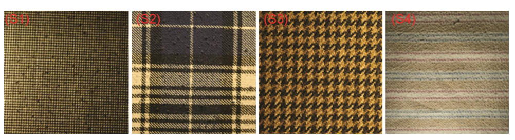
Fig. 1-Images of patterned samples after pilling resistance test