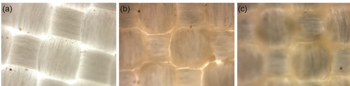
Fig. 3 — Microscopic images of samples after drop test [(a) non-treated Dyneema, (b) 34% STF treated Dyneema, and (c) 38% STF treated Dyneema]

mg.cm and the values for 34%, and 38% kaolin samples are 3611.02 mg.cm and 4502.05 mg.cm respectively. Conventional chest pad material with the similar dimensions does not indicate an adequate flexibility to provide an accurate reading from the instrument, indicating a higher stiffness value. Hence, the Dyneema samples impregnated with the STF combinations as mentioned above provides better flexibility than the traditional chest pad material.