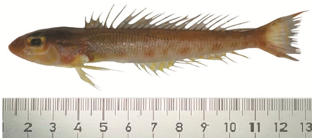
Fig. 2 — P. alboguttata , 115 mm TL from the Sonadia Island, South-east coast of Bangladesh, March 3, 2018

fisheries laboratory, Patuakhali Science and Technology University.