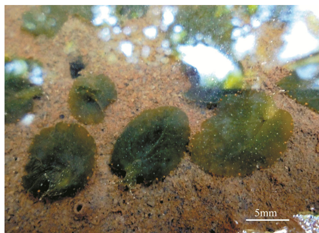
Fig. 2 — E. bangtawaensis on muddy substratum in shaded pool