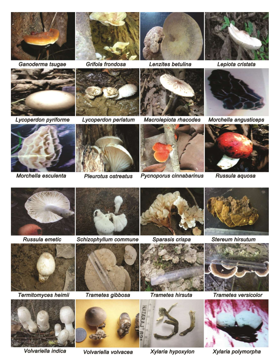
Plate 1 — 1.Agaricus silvaticus, 2. Auricularia auricular-judae, 3. Coprinellus micaceus, 4. Coprinopsis atramentaria, 5. Coprinus comatus, 6. Coprinus disseminatus, 7. Daldinia concentric, 8. Fistulina hepatica, 9. Fomes fomentarius, 10. Fomitopsis pinicola, 11. Ganoderma applanatum, 12. Ganoderma lucidum, 13. Ganoderma tsugae, 14. Grifola frondosa, 15. Lenzites betulina, 16. Lepiota cristata, 17. Lycoperdaceae pyriforme, 18. Lycoperdon perlatum, 19.Macrolepiota rhacodes, 20. Morchella angusticeps, 21. Morchella esculenta, 22. Pleurotus ostreatus, 23. Pycnoporus cinnabarinus, 24. Russula aquosa, 25. Russula emetic, 26. Schizophyllum commune, 27. Sparassis crispa, 28. Stereum hirsutum, 29. Termitomyces heimii, 30. Trametes gibbosa, 31. Trametes hirsuta, 32. Trametes versicolor, 33. Volvariella indica, 34. Volvariella volvacea, 35. Xylaria hypoxylon, 36. Xylaria polymorpha