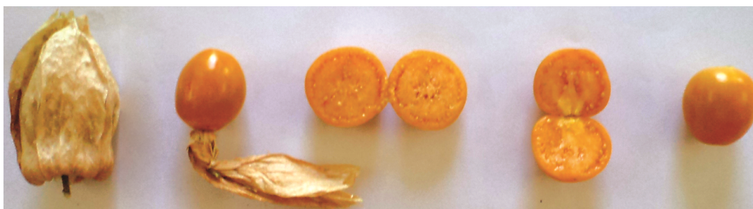
Fig. 1 — Fruits of Physalis peruviana with husk, open, lateral section and vertical section (fruit)

P. peruviana flourishes well in arid regions, protected land, well-drained soil, full sun or light shade 6 . A study was conducted to consider the effect of coloured-shade nets on physiochemical characteristics of P. peruviana in subtropical areas. T.A., S.S., S.S./T.A. relation, pH, Vitamin C, total phenolics and antioxidant capability were examined and it was found to have a better quality when grown in white, blue or black shade net 42 . A rich loam is favourable to it but can even bear poor soils and a rich soil promotes its leaf production with fruiting. The plants can tolerate a soil pH of 4.5 to 8.2. Several cultivars would tolerate temperatures down to about -10 °C when grown in this way. It would be wise to apply some defensive moisture condition to roots, especially in the late autumn following the peak growth incised back through frosts (Fig. 2).