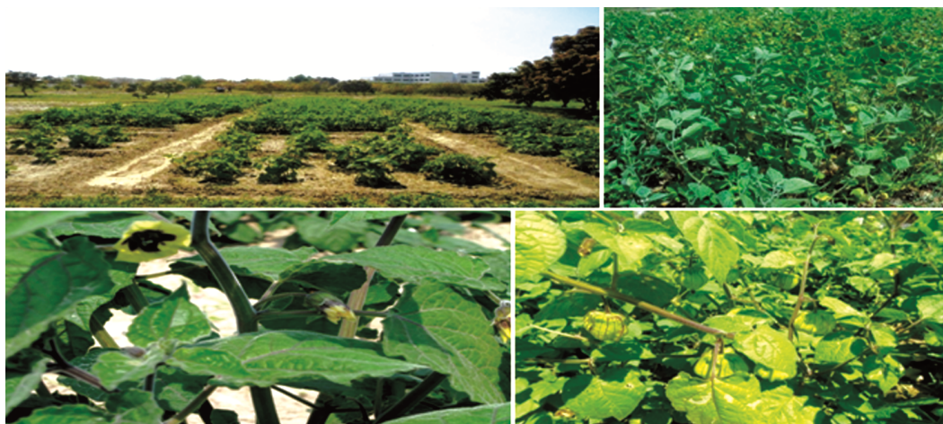
Fig. 2 — Cultivation of Physalis peruviana in central Uttar Pradesh (India)