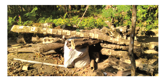
Fig. 6 — Agarwood craft-waste

Craft waste as carved remnants (scrapings) is generally collected (Fig. 6.), then sold, refined and extracted to obtain agarwood oil which is then sold as a fragrance. Waste is generally sold to Java or sold to communities (especially Arabian