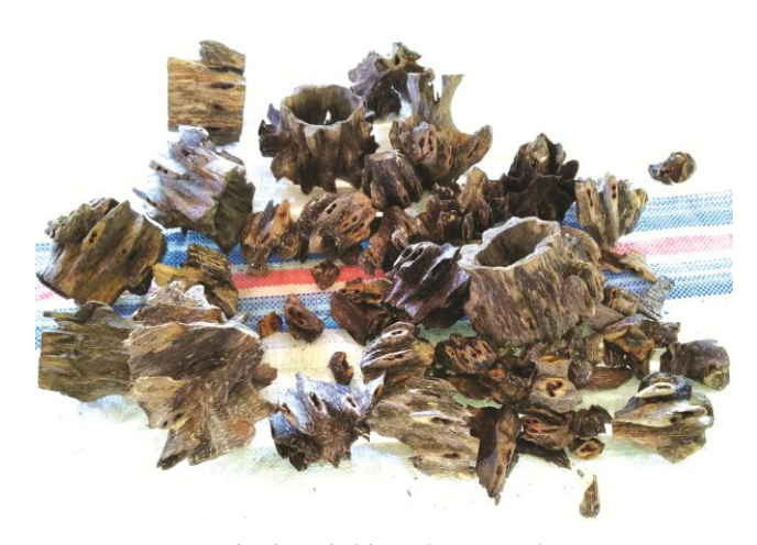
Fig. 3 — Cultivated agarwood

as ants). Meanwhile, the artificial resin could be obtained through fungal inoculation or local formulas (inoculation liquid made from herbs by local people) which are applied using the nailing method (Fig. 4) or zinc-plat method. Fungi that are usually used for