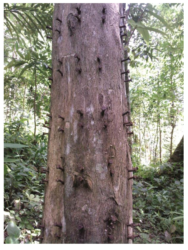
Fig. 4 — Nailing method

inoculation are Fusarium lateritium and Fusarium popullaria . Harvesting can be done in 6 months after being inoculated using fungal inoculum, but if the harvest is too late the plant will be damaged or fail in producing the resin. Agarwood farmers prefer to use local herbal ingredients they called "vaccine" for inoculation, for safety reasons in harvesting.