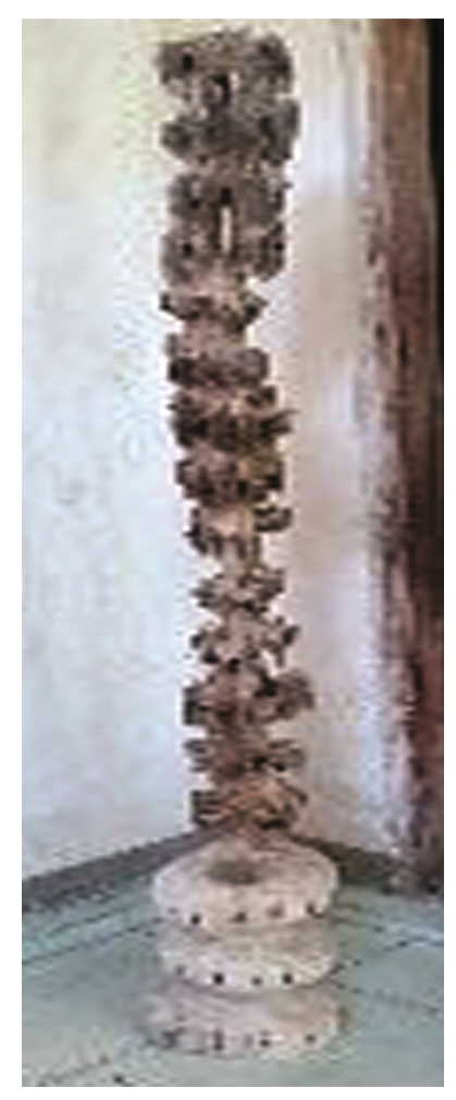
Fig. 5 — Agarwood handcrafts

low-quality agarwood stem with agarwood resin (generally from Pantai group) that has been scented with better resin from another group (such as Kalimantan agarwood). G. versteegii Pantai group is a special resin-producing eaglewood that can be inserted into ordinary or low-quality eaglewood stem, after being given a better quality aroma from another agarwood. The aromatic resin of G. versteegii Pantai group has a less sharp aroma (maybe due to low oil content) so that the craftsmen usually use the resin to insert into ordinary agarwood stem. A phytochemical test based on the content of lignin, cellulose, hemicellulose, total sugar, total starch and resin, agarwood of Pantai group has a close relationship with the Beringin group<sup>21</sup>.