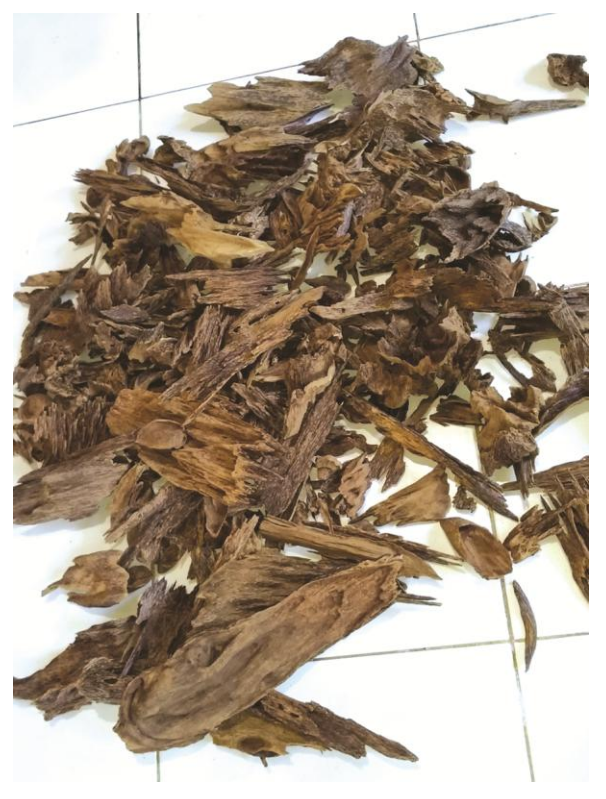
Fig. 2 — Natural agarwood

as ants). Meanwhile, the artificial resin could be obtained through fungal inoculation or local formulas (inoculation liquid made from herbs by local people) which are applied using the nailing method (Fig. 4) or zinc-plat method. Fungi that are usually used for