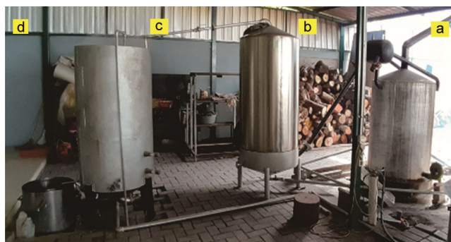
Fig. 2 — Steam distillation apparatus: a) boiler, b) kettle as the starting material place, c) the condenser, and d) separator.

through. A Kettle is made of high-quality stainless steel, has a diameter and height of 80 and 140 cm, respectively. The top of the kettle made a cone so that steam (water and essential oils) more quickly to the condenser. This tool is equipped with a stimulus made of stainless steel with a distance of 8 cm from the bottom of the surface of the boiler material, temperature control, pipes crossed at the bottom of the boiler material. The steam pipe is equipped with pressure, a faucet for condensing vapours, and also for washing laundry water. The top of the kettle is equipped with a swan neck shaped device to flow steam from the kettle to the condenser. Gooseneck shape is slightly curved and sloping direction 15° of kettle ingredients directly to the condenser.