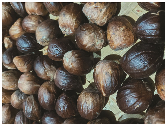
Fig. 1 — Dried young nutmeg seeds.

The kettle or the starting material place (Fig. 2b) functions as a nutmeg powder. The material put in a kettle without water, and steam from a boiler is forced