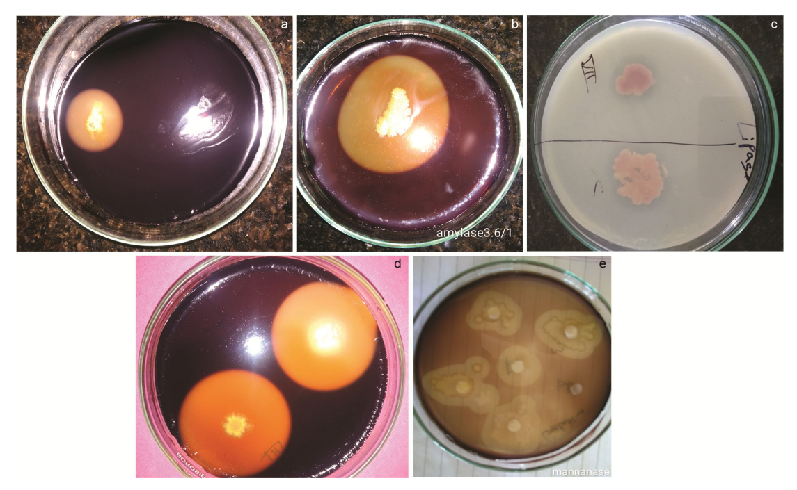
Fig. 1 — Screening for thermostable enzymes.