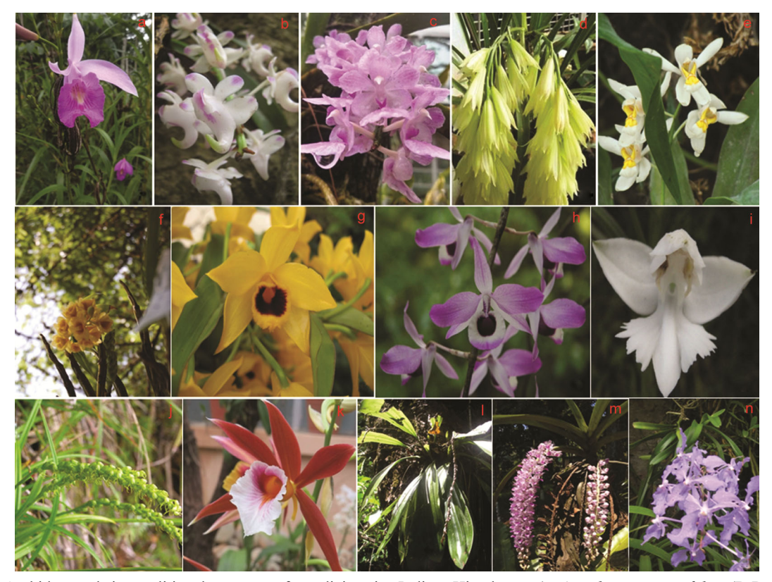
Fig. 1 — Orchids used in traditional system of medicine in Indian Himalaya. a) Arundina graminifolia (D.Don.) Hochr., b) Aerides odorata Lour., c) Aerides multiflora Roxb., d) Cymbidium elegans Lindl., e) Coelogyne punctulata Lindl., f) Dendrobium densiflorum Wall., g) Dendrobium fimbriatum Hook., h) Dendrobium nobile Lindl., i) Habenaria dentata (Sw.) Schltr., j) Herminium lanceum (Thunb. ex Sw.) Vuijk, k) Phaius tankervilleae (Banks) Blume, l) Pholidota imbricata Lindl., m) Rhynchostylis retusa (L.) Blume, n) Vanda coerulea Griff. ex Lindl.

To find out the relative importance of various ethnomedicinal orchid species effective in the treatment of various human-associated problems, a quantitative index frequency (%) was employed. The results of the study are presented in Table 3 which indicates that the frequency ranges from 5.63 to 52.11%. On the basis of frequency, the most orchid species investigated includes important L. nervosa (Fq=52.11%), C. aloifolium (Fq=50.70%), D. nobile (Fq=47.89%), P. muscicola (Fq=46.48%), A. odorata (Fq=45.07%), H. dentata (Fq=40.85%), D. densiflorum (Fq=39.44%), R. retusa (Fq=26.76%), and (Fq=26.76%). The А. setaceus least medicinal orchids investigated were A. graminifolia (Fq=5.63%) and Herminium lanceum (Fq=9.86%) (Table 3).