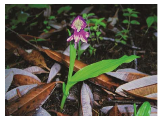
Fig. 1 — Roscoea alpina plant