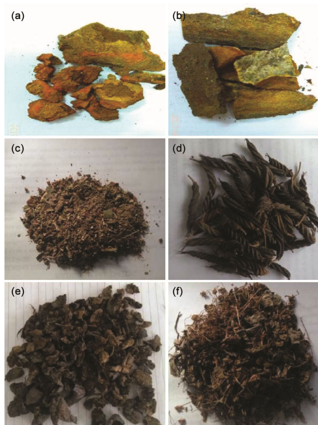
Fig. 2 — (a-f): Some of the extracted parts of the ethnomedicinal plants from Gohri forest division of Rajaji tiger reserve by Gujjars (a). Extracted Bark of Syzygium cumini (b). Ficus racemosa (c). Powder of Ocimum sanctum (d). Helicteres isora (e). Trifla ( Phyllanthus emblica , Terminalia bellerica , Terminalia chebula ) (f). Centella asiatica