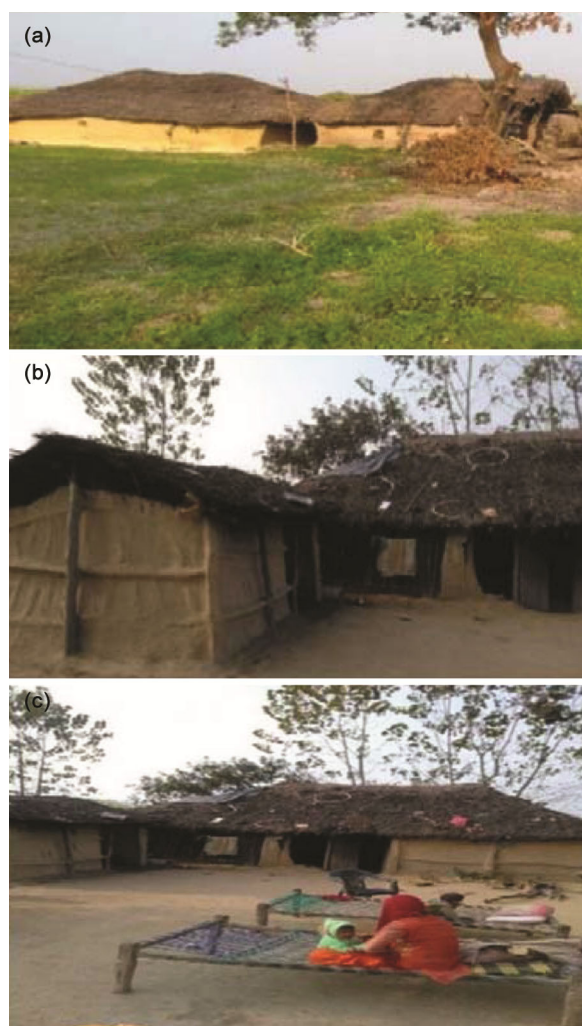
Fig. 3 — (a-c): View of Gujjars's shelter (deras) in Gohri Forest Division of Rajaji tiger reserve

maximum number of ethnomedicinal plants followed by Amaranthaceae (8.47%), Combretaceae and Lamiaceae (5.88%), Moraceae, Polygonaceae and Rhamnaceae (3.38% each), while rest of the family has contributed 1.69% of the total ethnomedicinal plant species. Our results are comparable with the earlier studies of worker 42 whose study reported Asteraceae with the leading family in terms of highest number of ethnomedicinal plants (Table 5).