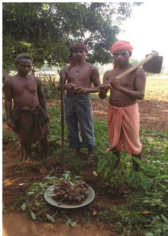
Fig. 4 — Harvested Colocasia