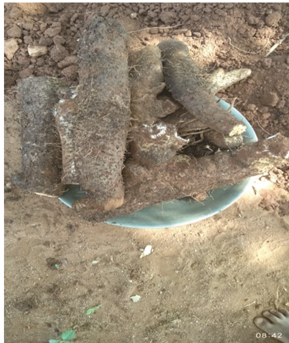
Fig. 3 — Harvested Cassava

and arrowroot. Out of these 7 species three species were found to be cultivated in the fields and other 5 species were available in wild (Fig. 3,4,5 & Fig. 6).