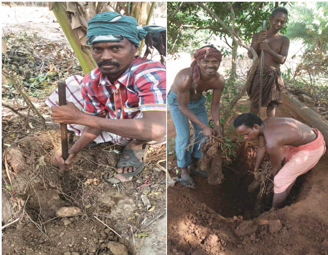
Fig. 5 & Fig. 6 — Digging out of Dioscorea spp. by the tribal people

The high dominance of wild species indicates that in many villages life is still traditional and local people remain dependent on nature. Regular harvesting from wild sources might be the cause for decrease in the production rate which was reported in South America and the production rate was decreased with 20.1, 1.2, 1.3% for tuber crops like cassava, sweet potato and yam respectively because of weather condition, disease and pest infestation 37,38 . Out of these species consumed by these tribes proportion of wild and cultivated species were also variable. This result establishes the truth that the tribal community depends on these tuber crops not only in the house hold nutrition but also as the supplementary food against paddy when the paddy production is low in variable climatic conditions. Maximum number of species was found to be consumed by the same tribe in different villages of these two blocks.