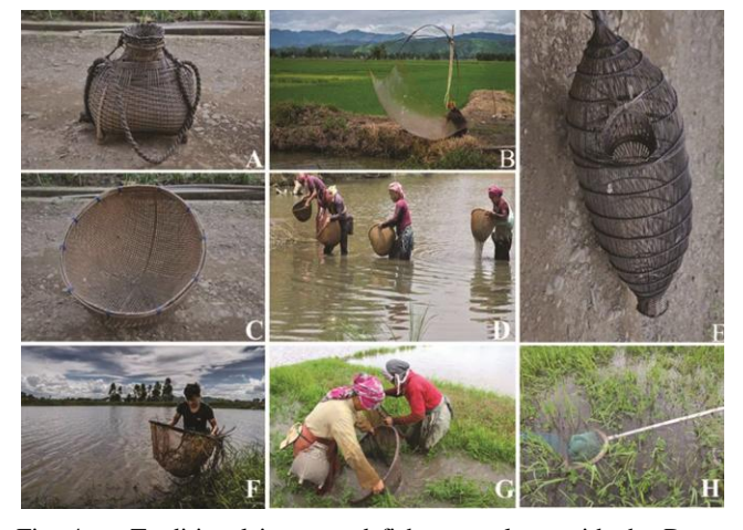
Fig. 4 — Traditional insect and fish traps along with the D-net (A- Tungol for keeping the fishes and insects while harvesting, B- Inn for catching and trapping fishes and insects in river or stream, C-Long, D-Women catching insects and fishes by using Long, E-Kaboru for trapping fishes and insects, F, G- Longthrao for trapping fishes and insects) and H- D-net scoop used for ecological sampling.

The locals after collecting the edible insects processed them for consumption, mostly after removing the wings. The processing and the ways of the consumptions of the edible insects in the given study area are given in the Table shown in the