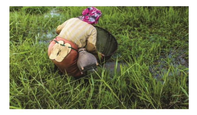
Fig. 3 — A woman harvesting edible insects and fishes in the Nganu pat area of the Loushi pat basin by using Longthrao. The container tied in the waist is Tungol for keeping the harvested insects and the fishes together.

made by nylon or cotton fibres. The circumference of the rim of the Longthrao is more than the Long . The harvester put the Long by holding with the hands with the rim toward the harvester and kicks the water or aquatic vegetation so that the fishes and the insects may found themselves trapped in the net. This act of collecting the fish and the insects is called Long Khonba . The traditional Long is made up of bamboo strips. They are used in the canals and streams which typically have stronger water currents.