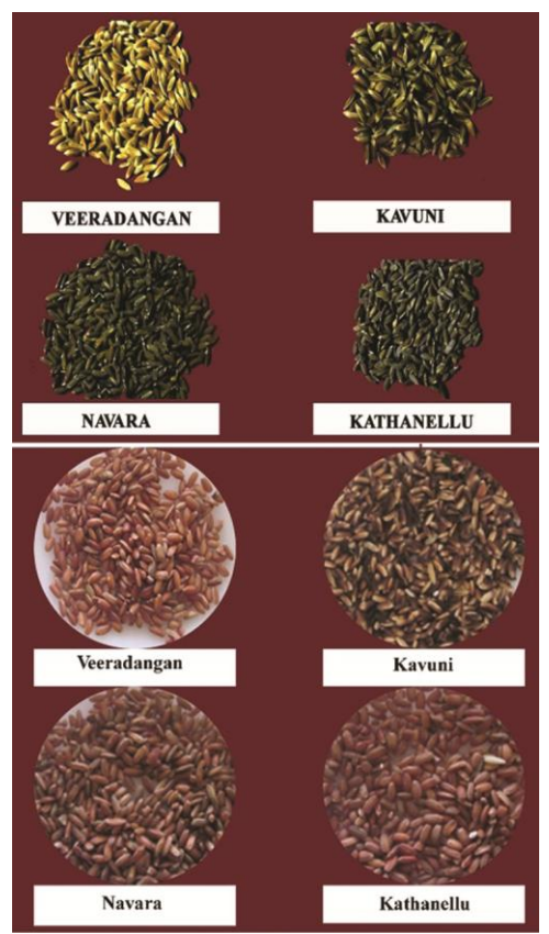
Fig. 1 — Seed Coat, Dehusked rice variation of land races in rice

Approximately 2 g of grained grain powder was taken in a small size flask with cover contains 12 mL