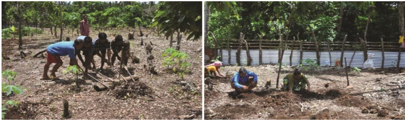
Fig. 4 —Land preparation and planting technique