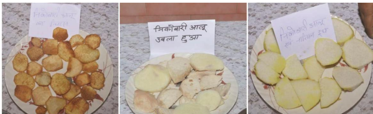
Fig. 9 —Different Nicobari aloo dishes

CIARI along with a check variety CARI-DA-1 (Yamni). The result revealed that, the accessions viz., CARI-DA-1, TAM-3, DA-3, DA-2 and RKP-4 are promising with yield more than 25 t/ha. (Table. 1). Among the Nicobar collections Tam-3 recorded the highest yield (33.6 t/ha) while Domrit was observed to be the very shy yielder.