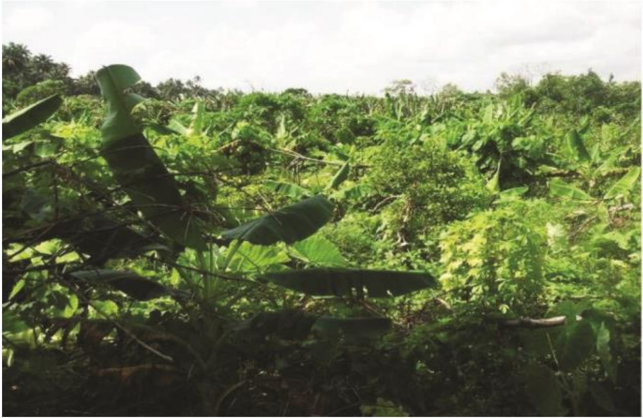
Fig. 3 —Traditional Tuhet garden comprising array of crops