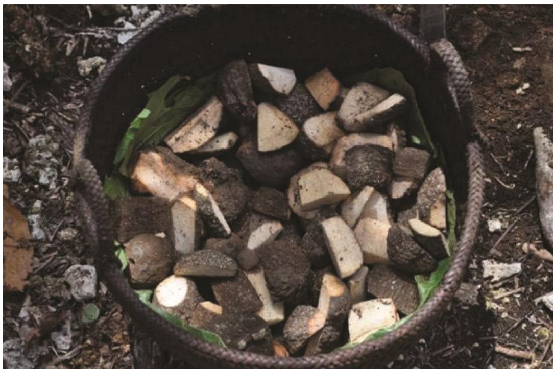
Fig. 7 —Planting material – cut pieces of tuber