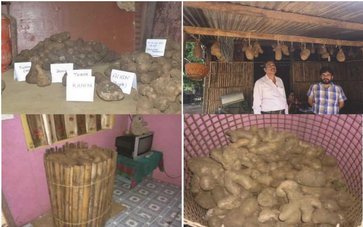
Fig. 8 —Methods of storage [heap (a), hanging (b), bamboo bin (c) and iron net bin (d)]

Efforts made at ICAR-Central Island Agricultural Research Institute (ICAR-CIARI), Port Blair has