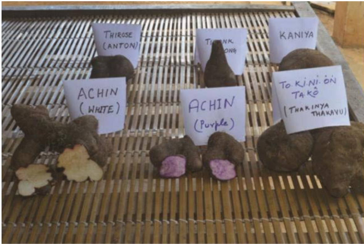
Fig. 2 —Diverse types of Nicobari Aloo

type are Talichong or submarine . The tubers are sweet and have smooth texture. The tubers are cylindrical and grow vertically deep in soils and hence are cultivated in deep soils. For ease of harvesting and limiting the length of the tuber, the Nicobari use a unique ITK. During sowing time, they keep rock / wooden plank or coconut shell at a depth of 2 – 2½ feet deep in the pit and then soil is filled ¾ of the pit and then piece of tuber is kept and filled with soil. This technique restricts the length of the tuber and increases its size. This variety is not a preferred gift during festivals and used for self/community consumption. The productivity of the type is considered as good and can be cultivated on any type of soil.