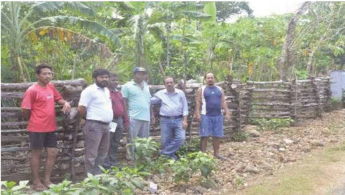
Fig. 6 —Traditional unique wooden fence

Nicobari aloo is harvested after six to seven months of planting which coincides with their festive season