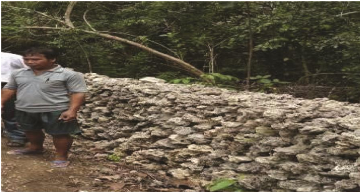
Fig. 5 —Traditional coral rock fence