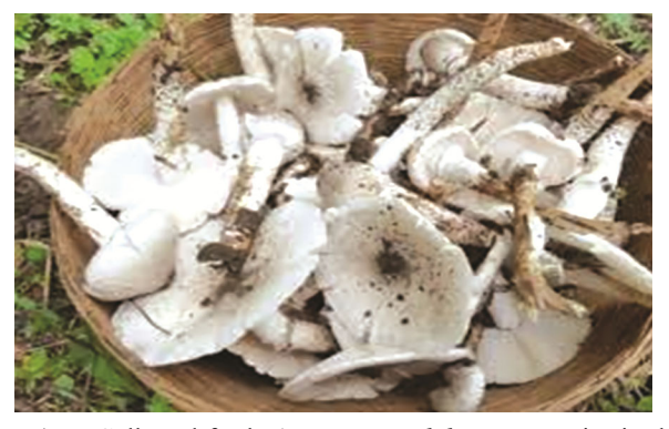
Plate 1 — Collected fresh Agaricus trisulphuratus species in the forest

Besides these, during the study 11 ranges were selected from the forest. Each range had approximately 200 families. A study of 2200 homes has been conducted to determine how many women are involved in the gathering of mushrooms to boost local economies. The amount of money made from the sale of various types of mushrooms and their contribution to overall earnings could not been calculated. The most likely causes include lack of suitable markets, inadequate transportation options, insufficiently high sale prices, and middlemen's