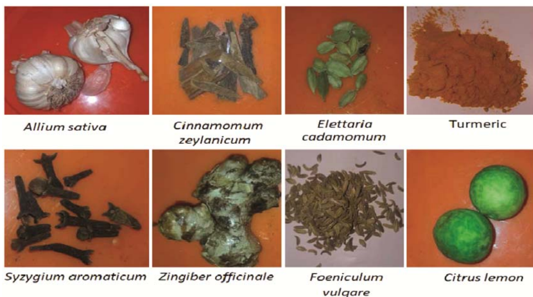
Fig. 4 — Aromatic herbs with antiviral activity used in traditional medicine

as anti-inflammatory concoctions and natural decongestants. They also dissolve mucus and relieve chest congestion 59,60 .