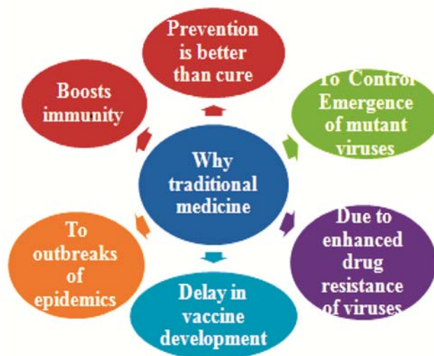
Fig. 2 — Need for an alternate therapy to manage COVID 19

For different illnesses, including viral infections, herbs have been exploited since ancient times as natural remedies. Traditional medicines (TMs) make use of many herbs and their products with effective results as recorded by fossil records dated back to 60000 years. Various forms of traditional medicine are Ayurveda, Siddha, Unani etc, which employ many natural products are being practiced for thousands of years globally. In India Ayurveda dates back to the pre-Vedic epochs (4000 BC–1500 BC) 20 . Though there are positive results observed by administering herbal drugs, major constraints are unavailability of an allopathic drug and lack of knowledge of the viral