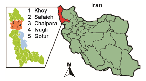
Fig. 1 — Study area map showing Khoy city, West Azerbaijan Province, Iran.

Khoy plain is located on the Southeast side of Armenian plateau with an average elevation of 1139 m. Gotur river originating from the highlands of Turkey flows into Khoy plain near the Chaoshgoli village. The river separates into two branches in the