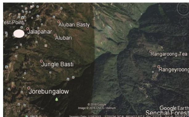
Fig. 1 — Location map of Darjeeling showing study area Alubari Jungle Busty (Google Earth)