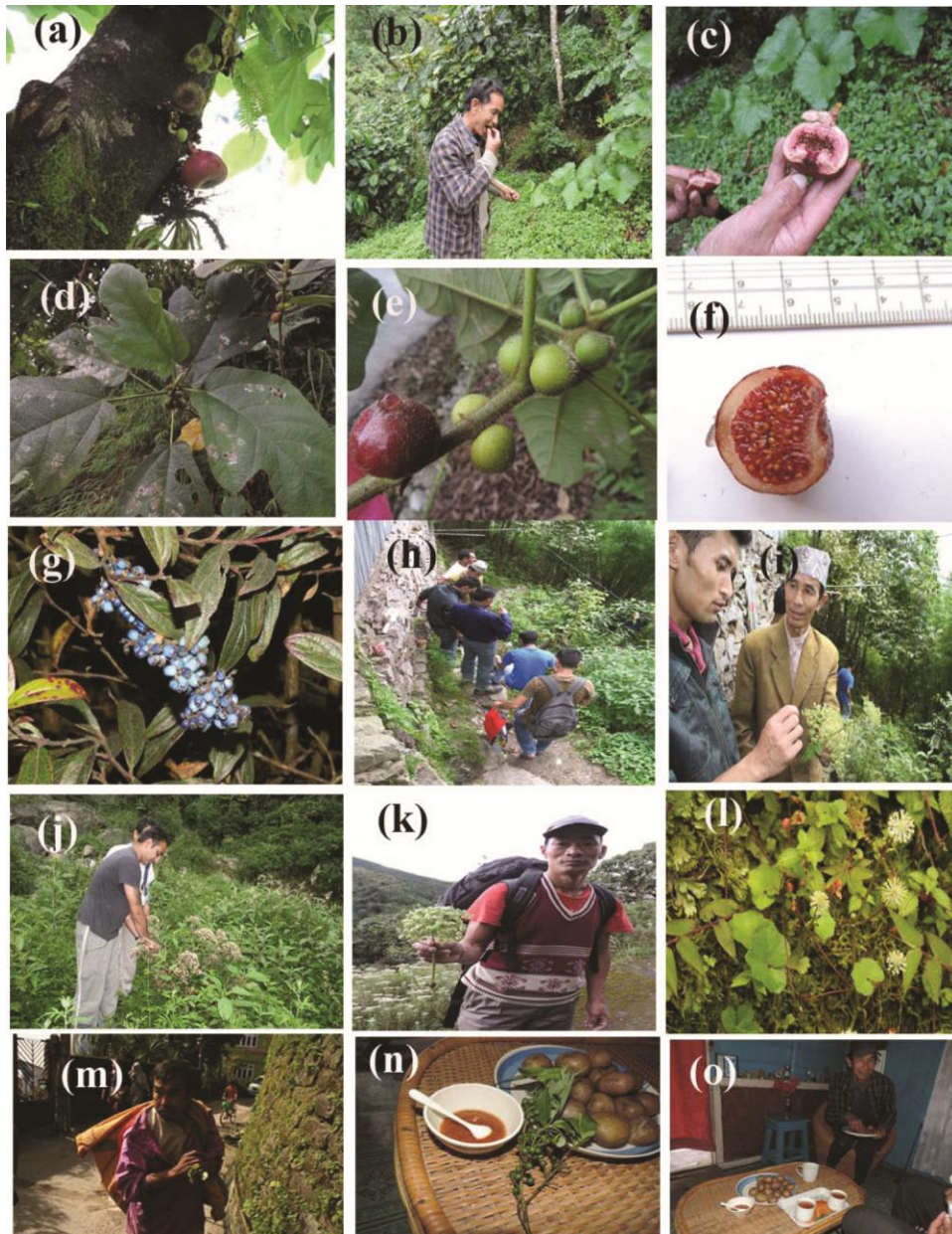
Fig. 3 — Ethnomedicinal plants of Alubari Jungle Busty in Darjeeling Himalaya: – (a–c) Fruits of Ficus auriculata Lour. along with Knowledge informant; (d–f) Fruits of Ficus carica L. with knowledge informant; (g–h) Fruiting twigs of Gaultheria stapfiana Airy Shaw; (i–k) Fruiting twigs of Heracleum wallichii DC. along with knowledge informants; (l–m) Hydrocotyle himalaica P. K. Mukh. along with knowledge informant; (n–o) Fruits of Litsea sericea Wall. along with knowledge informant.

increase body's energy and immunity as well as good stomach and liver functioning. Use-2: 8–9 fresh or raw fruits (chewed after lunch daily till symptoms disappear) are prescribed to the patients suffering from any type of viral fevers including COVID-19 (as practising by the second author: JKT). Voucher specimen: 2 km down from Alubari T. N. Road, inside Jungle Busty after the first village, 6000 ft, 19.05.2019, S. Panda & JK Thami 667 (MAC).