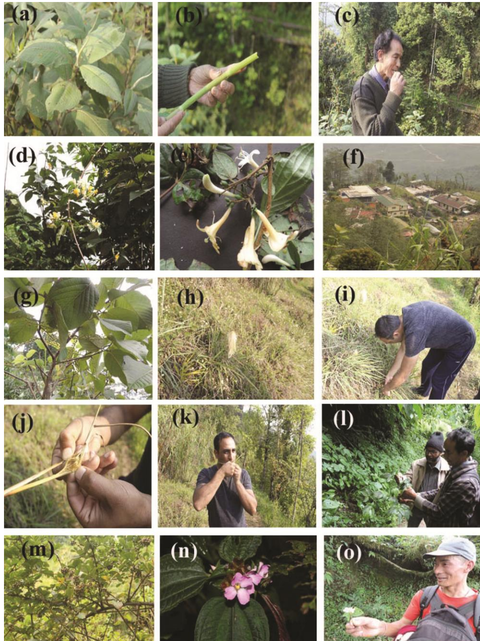
Fig. 4 — Ethnomedicinal plants of Alubari Jungle Busty in Darjeeling Himalaya: – (a–c) edible stems of Koenigia mollis (D. Don) T. M. Schult. & Reveal along with Knowledge informant; (d–f) leaves and flowers of Lonicera glabrata Wall. along with its habitat in 2 nd village; (g) leaves of Lyonia ovalifolia (Wall.) Drude; (h–k) edible spikelets inflorescence of Miscanthus nepalensis (Trin.) Hack. along with Knowledge informant; (l) Piper peepuloides Roxb. along with knowledge informant; (m) young twigs of Rubus ellipticus Sm.; (n–o) stems and leaf petioles of Sarcopyramis nepalensis Wall. along with knowledge informant.

Vernacular name : Dabai pan (Thami, Tamang and Sharma); Jangali pan (Moktan, Sarki, Gurung and