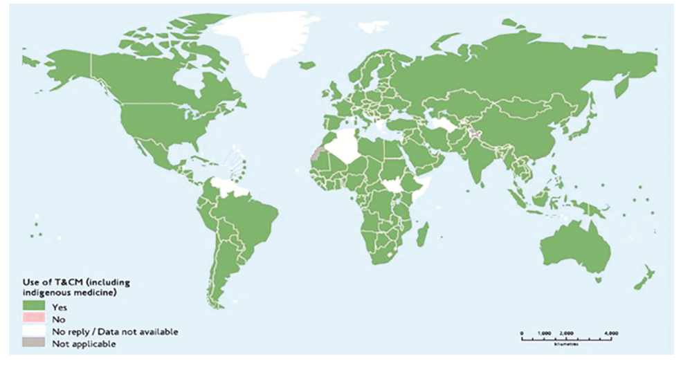
Fig. 2 — Countries using traditional medicine

NRGs have various applications in medicine and communities' socio-cultural, spiritual, and health needs. Local people use medicinal formulations from the gums and resins obtained from the trees to treat injuries, neurological disorders, and other ailments.