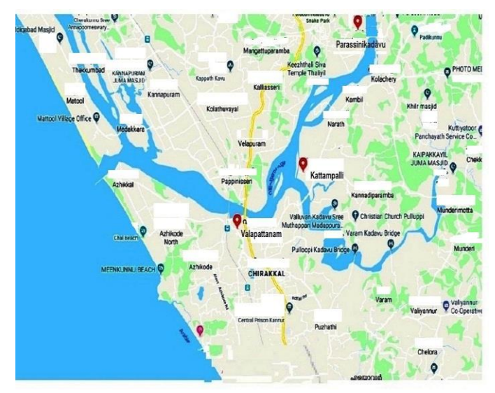
Map Showing the Study Sites in Valapattanam Region