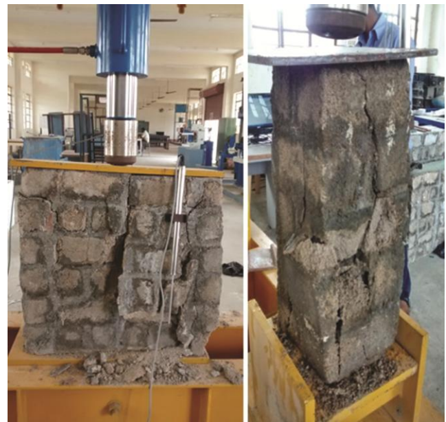
Fig. 2 — Failure patterns of MKBP